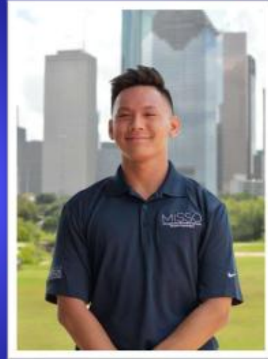
Technology: Deyja Vu