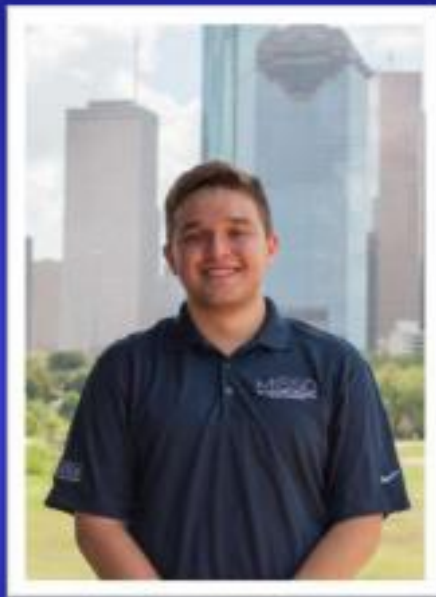
Media: Pascual Moreno